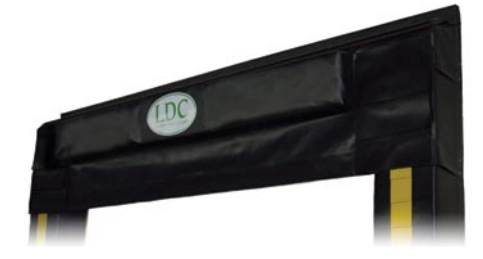
1/2 FOAM FACE VELCRO SPLIT

Low temp PVC strips can be used for non-adjustable applications to suit a variety of trucks.