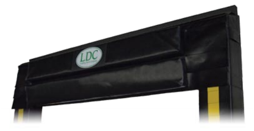
FULL FOAM FACE VELCRO SPLIT

The top half of the curtain has a 4" thick fixed foam pad while the bottom of the curtain has a velcro split.