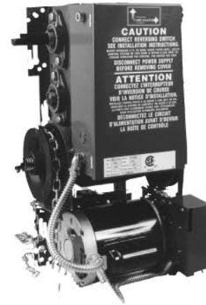
Industrial continuous duty belt drive jackshaft operator with emergency chain hoist