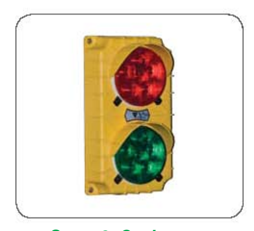
STOP & GO LIGHTS