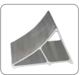
ALUMINUM WHEEL CHOCK