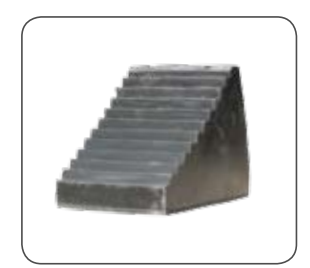
RUBBER WHEEL CHOCK